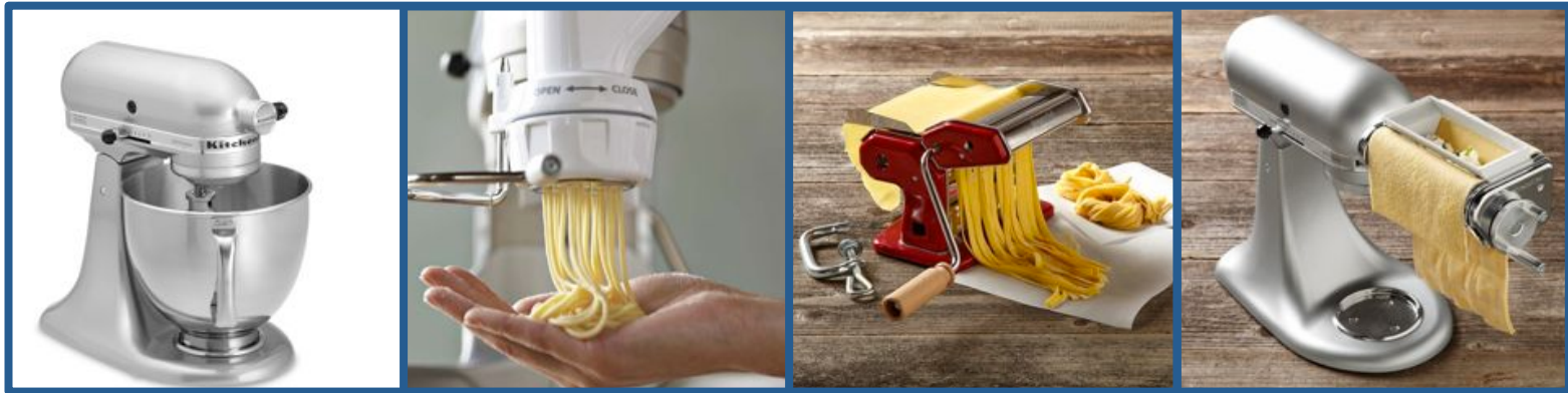
Example of other pasta-making products requiring different steps in making pasta

The Viante Pasta Maker is the ONLY product in the market that allows you to prepare 14 different types of pasta in an easy to use product. Just Mix, Extrude and Cut.